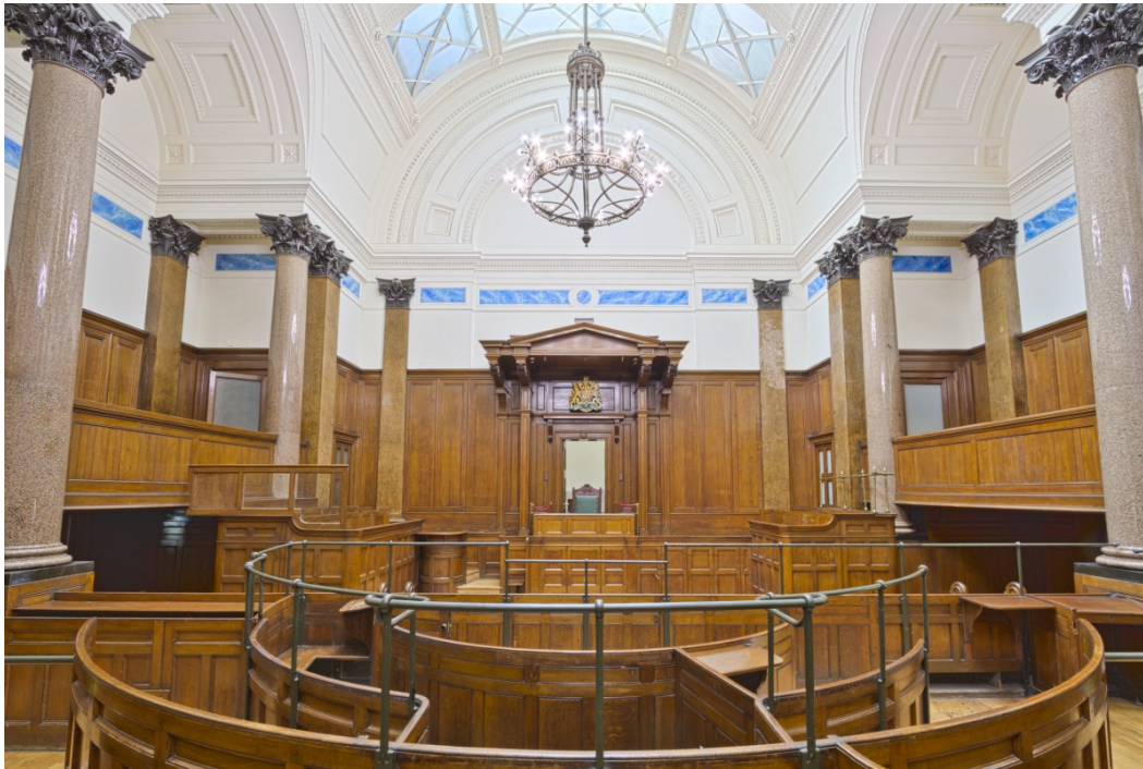
"Dieses Foto" ist lizenziert gemäß CC BY-SA .