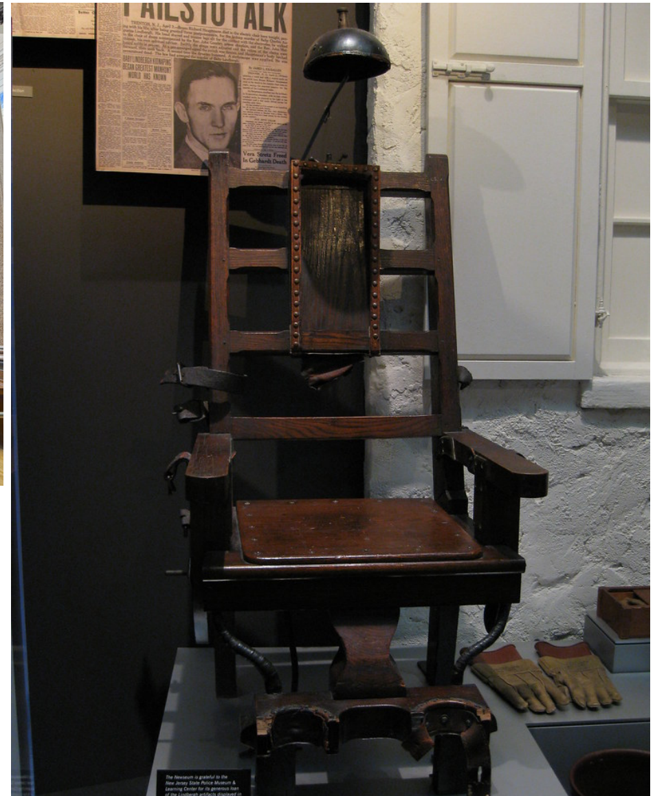
"Dieses Foto" von Andrew Bernand ist lizenziert gemäß CC BY-NC-ND .